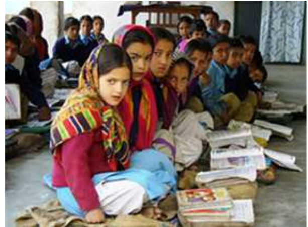
Education – the road to empowerment

All Children should have Quality Education: Plan works closely with communities, children, parents, teachers and local government to improve the quality of education, to make the schools child friendly and to ensure school attendance. Parents are motivated to continue education of their daughters.