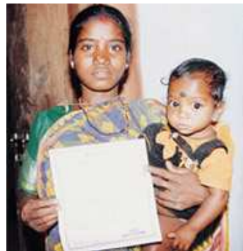
Now, my son has an identity - A birth certificate

Child centered programmes with participation of children: Plan believes in child centered community development. Through its programmes, Plan along with its partner organisations strives to empower children, families and communities so that children's rights are recognized and issues affecting them are amongst the wider agenda of adults, civil societies and the government.