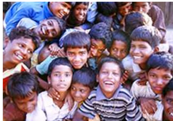
Our name is Today

Over the next five years Plan together with its partners, aims to reach out to some of the poorest areas of the country, in the states of Bihar, Madhya Pradesh, Orissa, Rajasthan, Uttarakhand, Uttar Pradesh, Jharkhand and Chhattisgarh (marked in blue on the map). Plan will gradually move out of the Southern states, Andhra Pradesh, Karnataka, Maharashtra and Tamilnadu, where it has been working for many years and which show improved health, education, and overall standard of living.